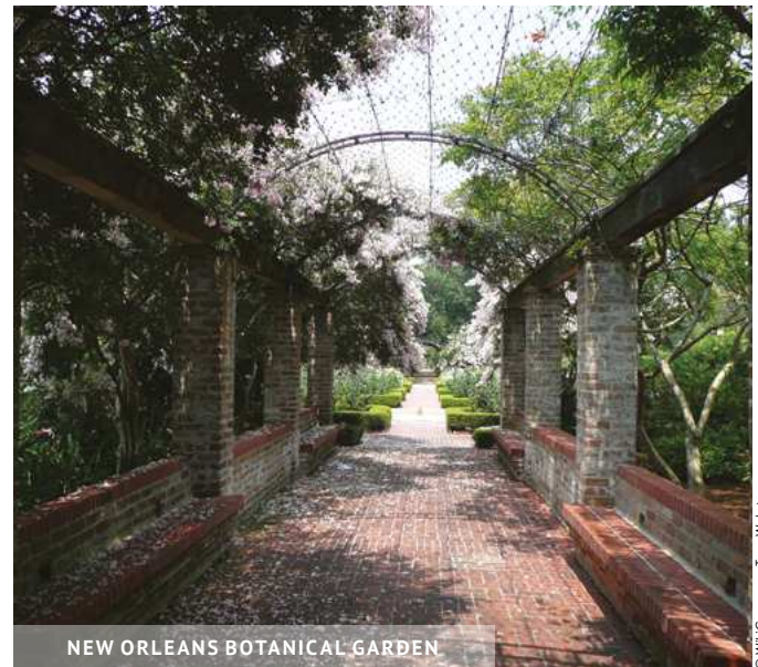
NEW ORLEANS BOTANICAL GARDEN