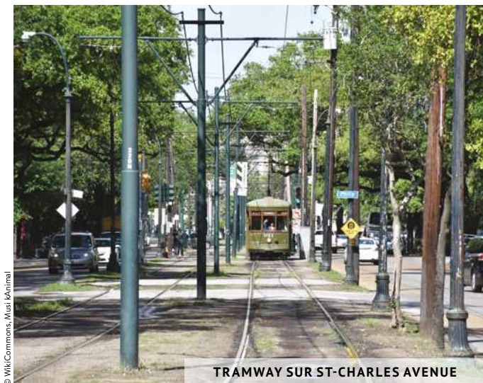
TRAMWAY SUR ST-CHARLES AVENUE