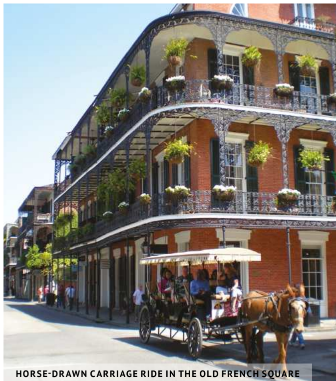
HORSE-DRAWN CARRIAGE RIDE IN THE OLD FRENCH SQUARE