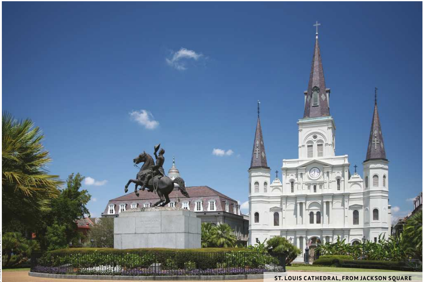
ST. LOUIS CATHEDRAL, FROM JACKSON SQUARE

Hurricane Katrina , one of the most powerful hurricanes in American history, struck the Louisiana coast on August 29, 2005 . When Katrina hit New Orleans' badly engineered levee system, it caused a terrible disaster, flooding 80% of the city. About 1,836 people lost their lives during Katrina or in the floods that followed. The material damage has been estimated at more than 108 billion dollars .