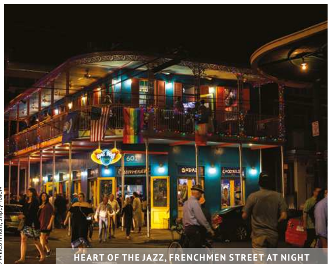
HEART OF THE JAZZ, FRENCHMEN STREET AT NIGHT