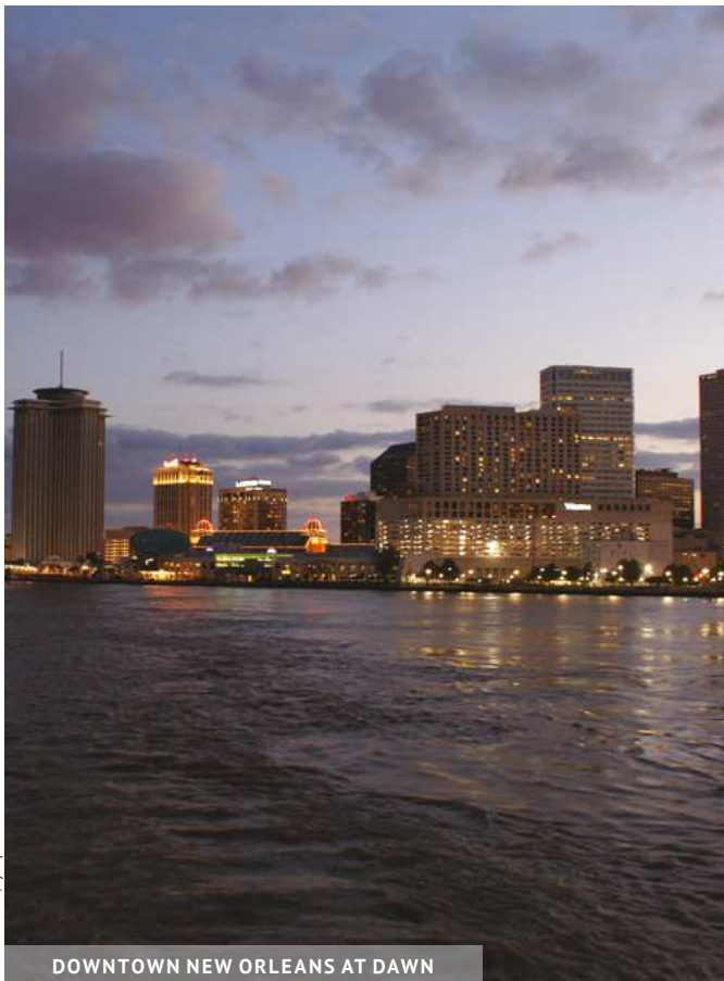
DOWNTOWN NEW ORLEANS AT DAWN