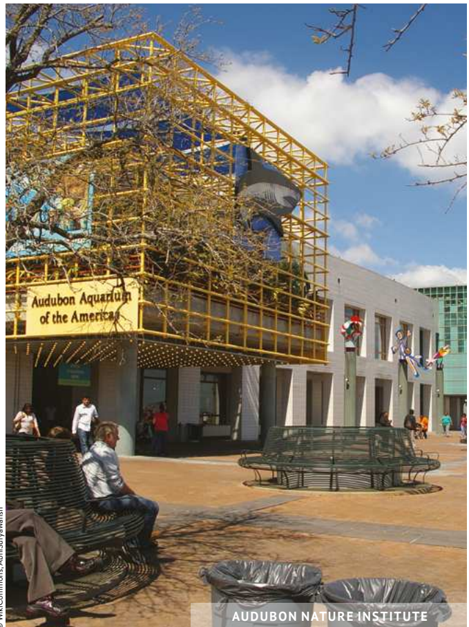
AUDUBON NATURE INSTITUTE