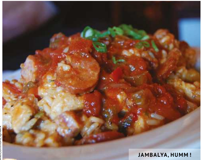
JAMBALYA, HUMM !