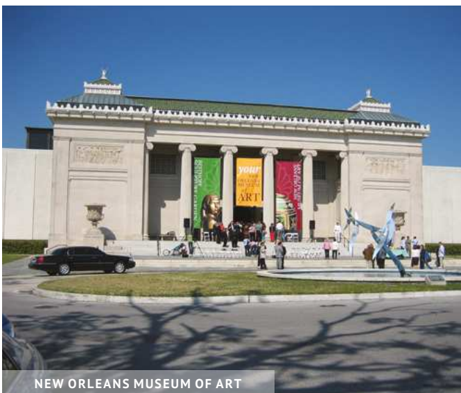
NEW ORLEANS MUSEUM OF ART